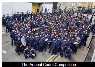
The Annual Cadet Competition