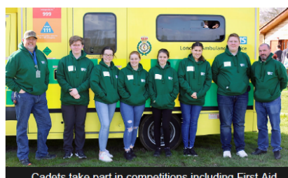
Cadets take part in competitions including First Aid

During School holidays many of our Cadets go on camps and trips. Some of these are day events like trips to visit the crime museum or take part in white water rafting, some are week long camps, taking part in many different outdoor activities like Mountain biking, Ghyll Scrambling, Climbing and caving. We also offer leadership training days.